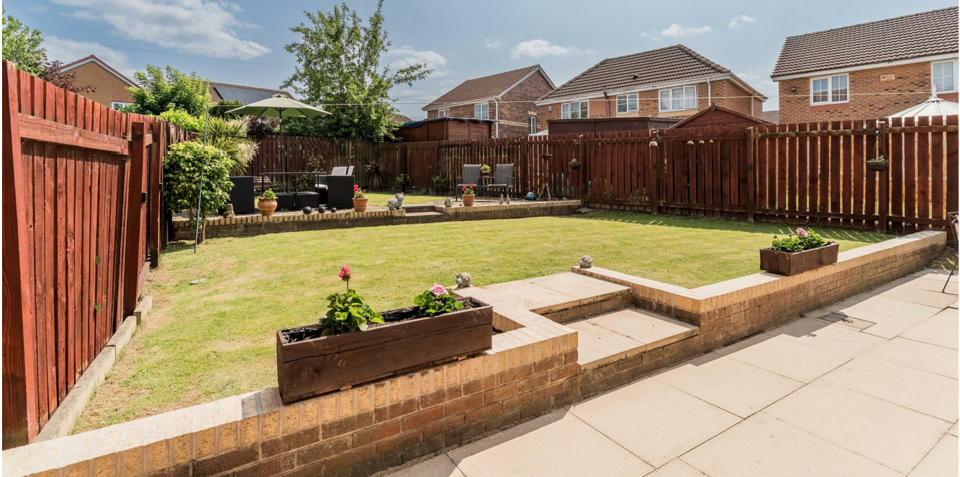
2 Magdalene Fields, Normanton, Normanton, WF6 1UE